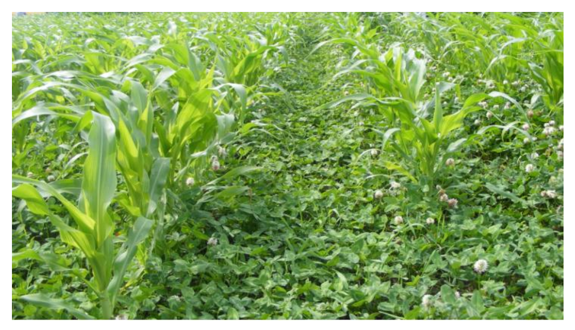
Fig. 2: Live mulch for moisture conservation

Water use efficiency is also another intercropping importance of system. Integration of legume either in sole or in the intercropping systems has he potentiality to extract more moisture from deeper soilsurface. Intercropping with legumes is an excellent practice for controlling soil erosion and sustaining crop production. Sorghum-cowpea intercropping reduced runoff by 20-30% compared with sorghum sole crop and by 45-55% compared with cowpea monoculture. Moreover, soil loss was reduced with intercropping by more than 50% compared with sorghum and cowpea monocultures.