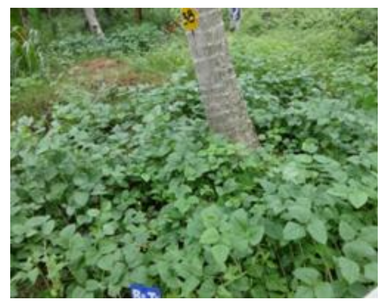
Fig. 3: Calapogonium intercropping for weed control

parasite infections (Fenandez et al., 2007) which ultimately may improve the soil fertility, crop yield and farmer's income.